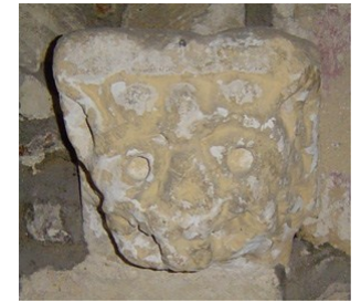
Lion over the Switchgear (Gargoyle)

At the east end of the north aisle is a bracket containing a 15th century lion. Look closely and you will find other gargoyles around the church (inside