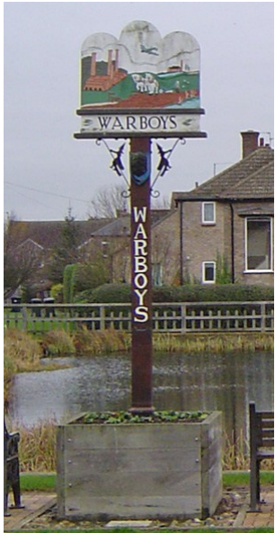
Warboys Sign by the Weir