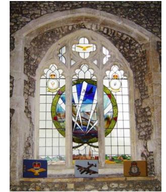
RAF Commemorative Window

The font is of the early 13th century, the square bowl is carved with crude foliage standing on one large and four smaller shafts mounted on the base. The wooden cover also has an interesting background: It was made during the restoration work of 1926 from old beams salvaged during the restoration work. The font was moved