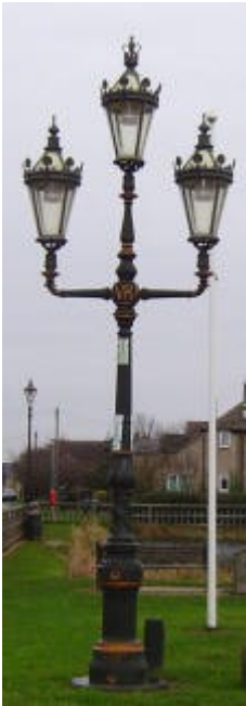
Three Globed Lamp (by the Weir)