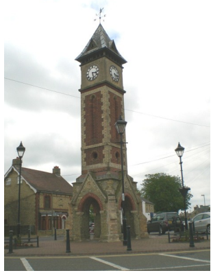
Warboys Clock Tower

The Romans brought Christianity to East Anglia. The history of religion during the early centuries AD was probably a mixture of Christianity and Paganism. In 655AD the first Abbey in Peterborough was founded. The Viking invasions of the 7th century destroyed churches and monasteries but in 974AD Archbishop Dunstan donated the land known as Warboys to Ramsey Abbey. Christian activity is recorded in the Domesday book, of 1086AD, which stated there was a priest and a Church in Warboys.