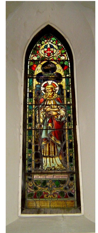
Stained Glass Window in South Wall of Chancel