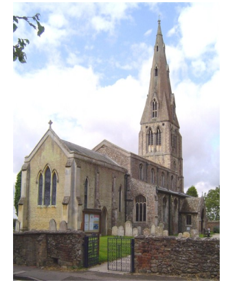
Warboys Parish Church

The earliest part of the current church was built during the 12th century—this church consisted of a chancel, the present nave and a north aisle. From this Norman church only the chancel arch (see adjacent picture) and a small piece of walling in the south west corner of the nave have survived.