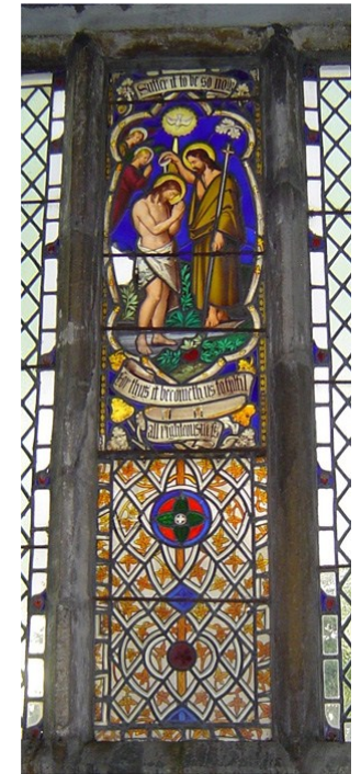
Stained Glass Window in South Vestry