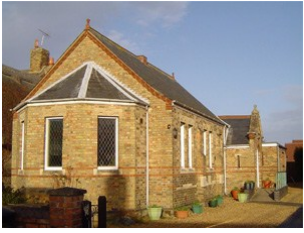
Warboys Methodist Church