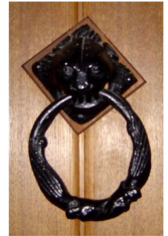
12th Century Bronze Knocker

During the second world war there was an airfield at Warboys. Many forces personnel who lost their lives are remembered in the church on plaques or in the Book of Remembrance. 156 Path Finder Squadron has a lasting association with the church. A stained glass window in the south aisle marks