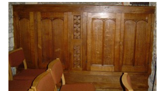
Panels from old Pulpit (used to cover switchgear)