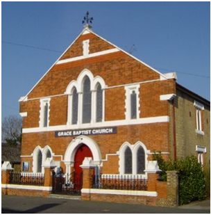
Warboys Grace Baptist Church

The first recorded settlement was known as Wardebusc (Saxon lookout woods) and was positioned at a fork in the road which skirted the fen between St Ives and Ramsey. By 1150 this had been changed to Wardebois (French influence) which was shortened to Warbois before finally becoming Warboys.